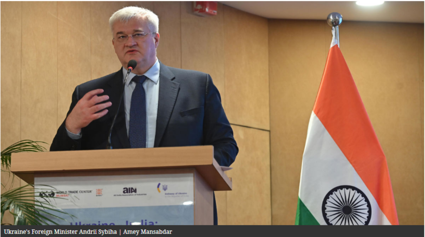
Ukraine's Foreign Minister Andrii Sybiha

Ukraine's Foreign Minister Andrii Sybiha said the country wants long-lasting and comprehensive peace and an end to the war this year. He was speaking in Mumbai where Ukraine opened its new Consulate General.